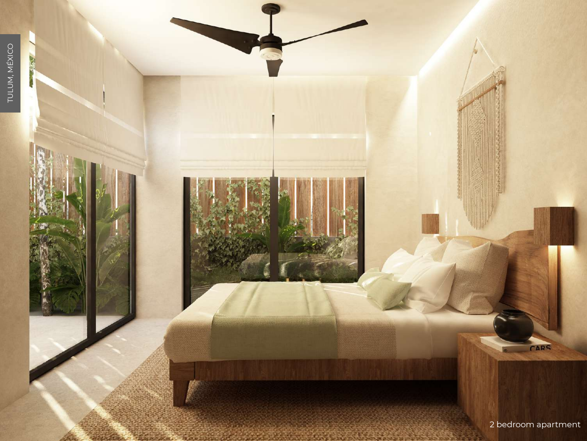
2 bedroom apartment