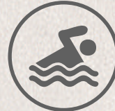
Ground floor pool