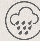
Rainwater harvesting system