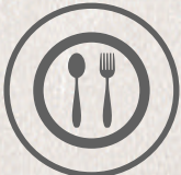
Commercial space for restaurant