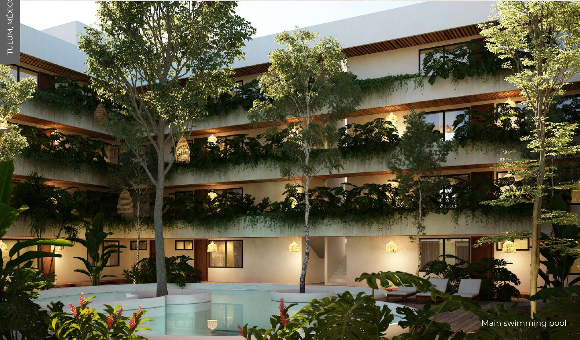
Main swimming pool