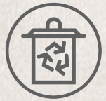
Waste separation area