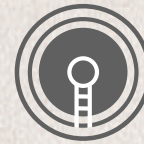
A residual water treatment plant

Sustainable use of natural resources, such as wind, sun and water, through: