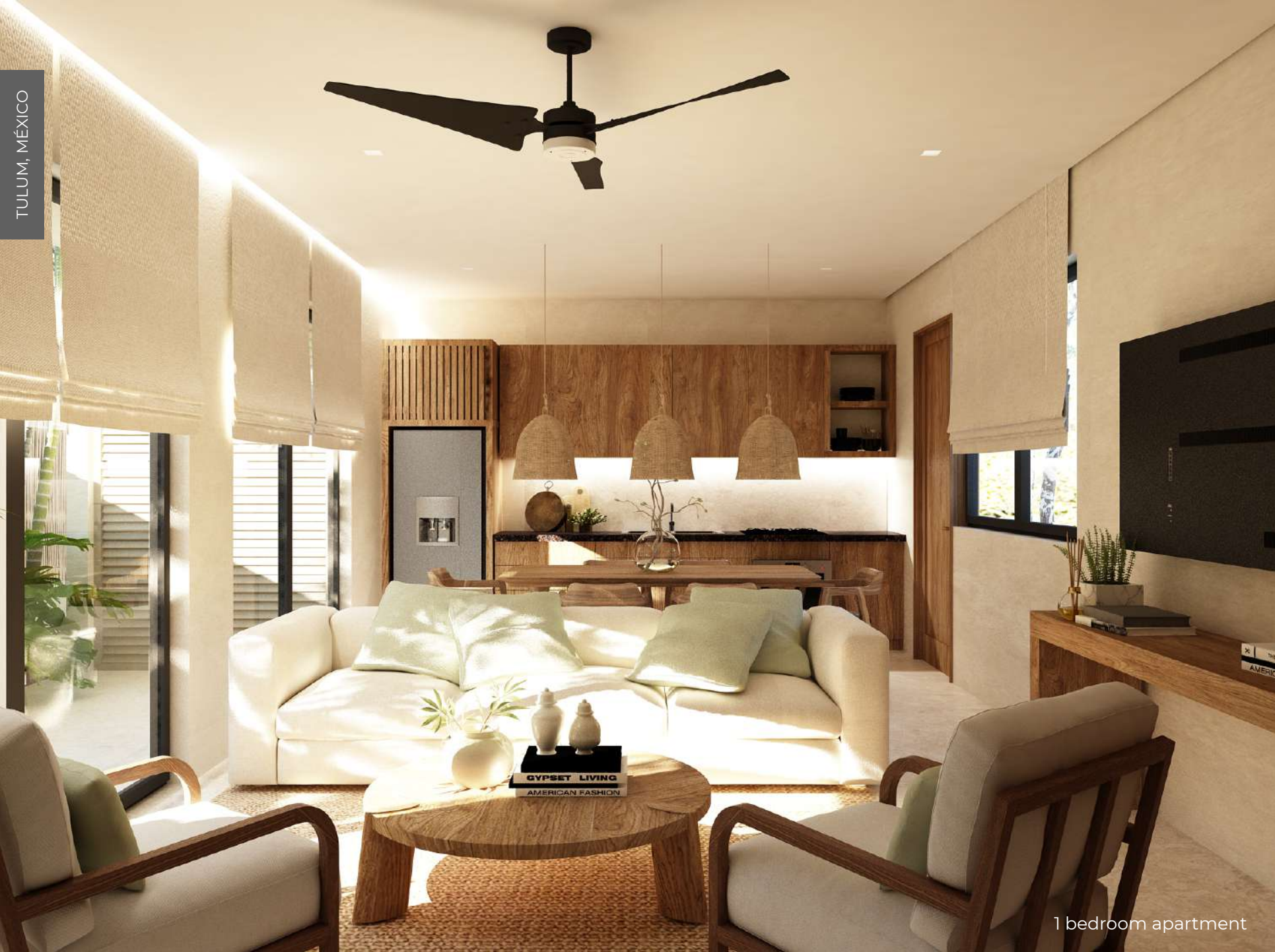
1 bedroom apartment