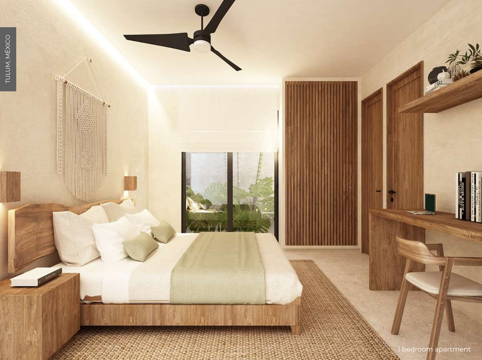
1 bedroom apartment