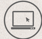
Coworking with a private area for meetings