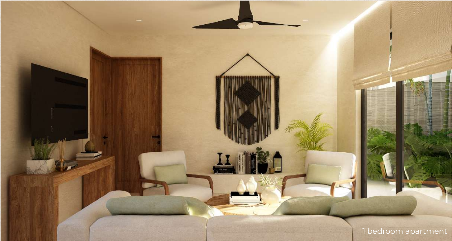
1 bedroom apartment

At CANOPIA, we design double environment studios and apartments of 1, 2 and 3 bedrooms, characterized by their large, illuminated and ventilated spaces, immersed in a sensation of pleasant security in the middle of a jungle and beach environment.