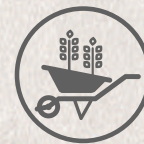
Use of natural and regional construction materials