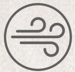
Natural cross ventilation